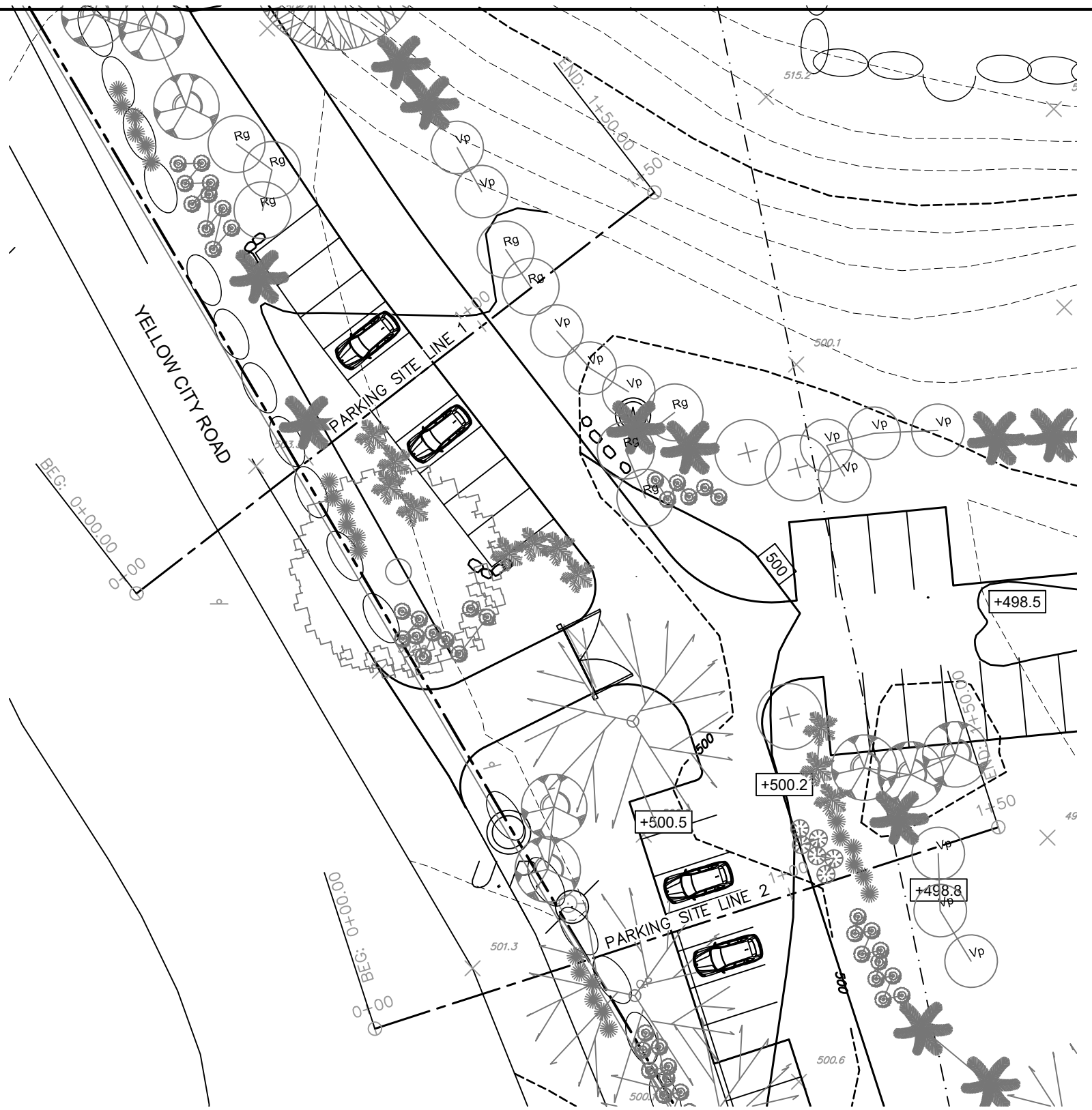
PLAN SCALE: 1" = 30'